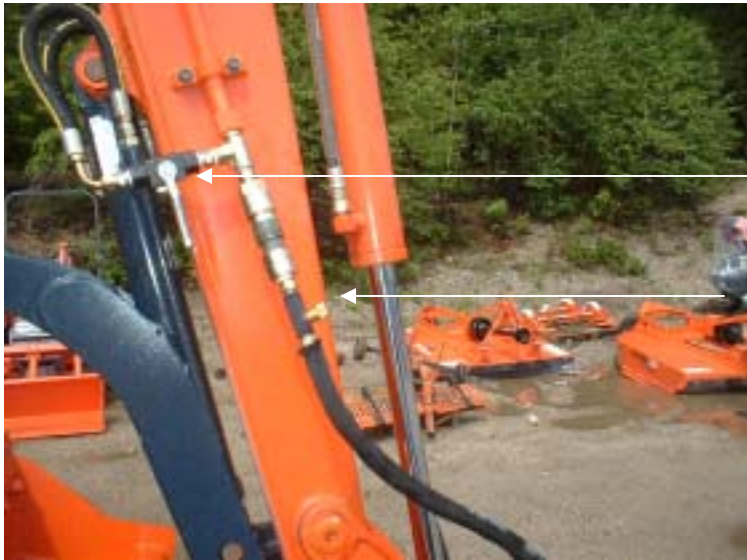
High Pressure Ball Valve

Install Flow Control Valves, Ball Valves and a Thumb Lock, as shown below.