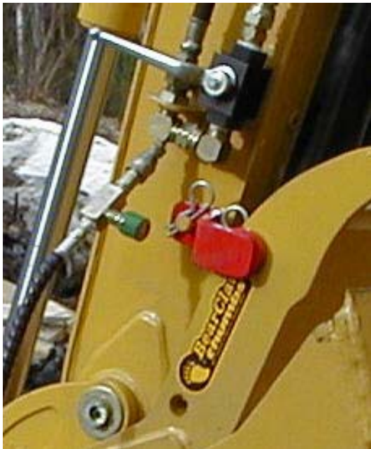
Flow Control Valve