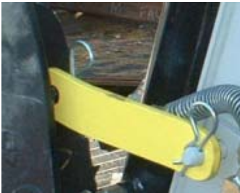
Sample photos of Thumb Locks